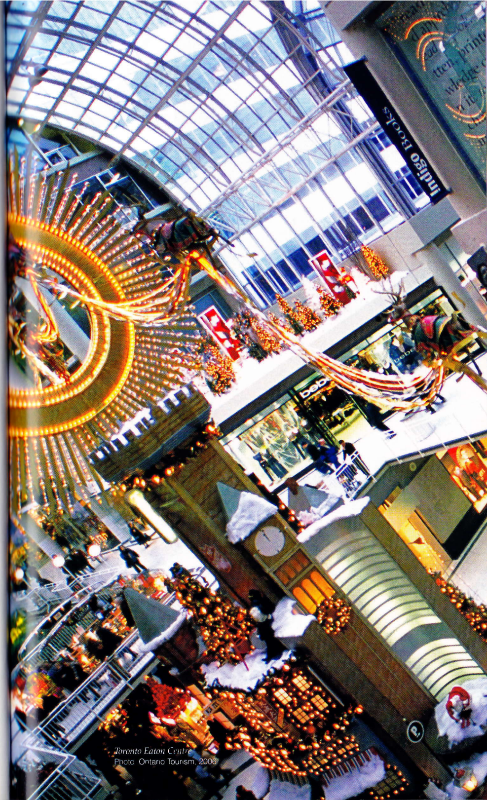
Toronto Eaton Centre

It isn’t Christmas without the Nutcracker — seeing this beloved classic at the spectacular new Four Seasons for the Performing Arts will make this holiday season truly unforgettable.